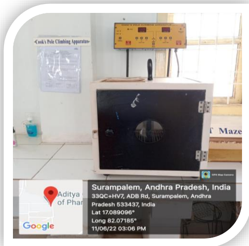
Cooks pole climbing apparatus