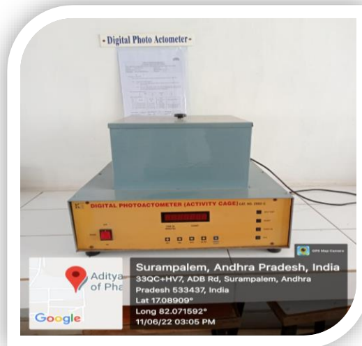
Digital photo actometer